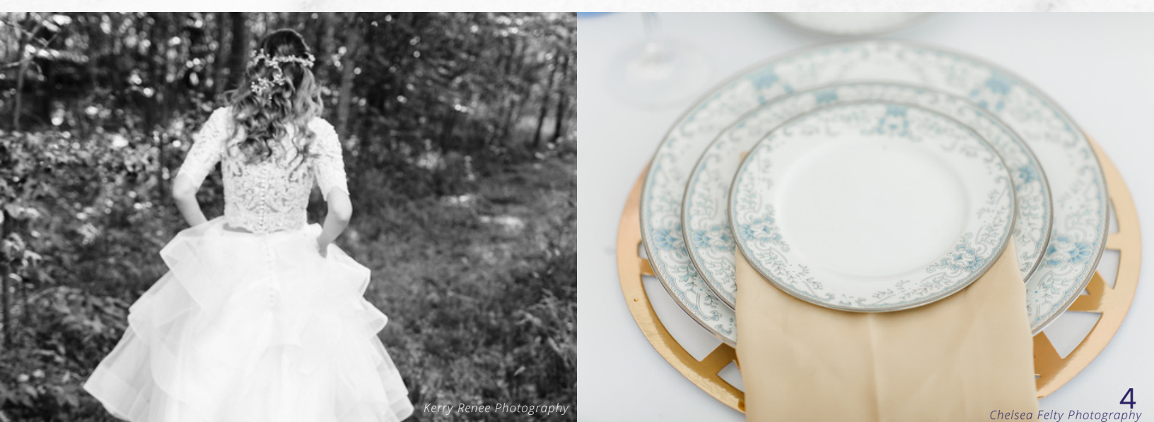
All pricing is subject to change.

We tailor all packages to suit the specific needs of each couple. Contact us to arrange a complimentary consultation to discuss the details of your wedding and we will create a customized package, especially for you.