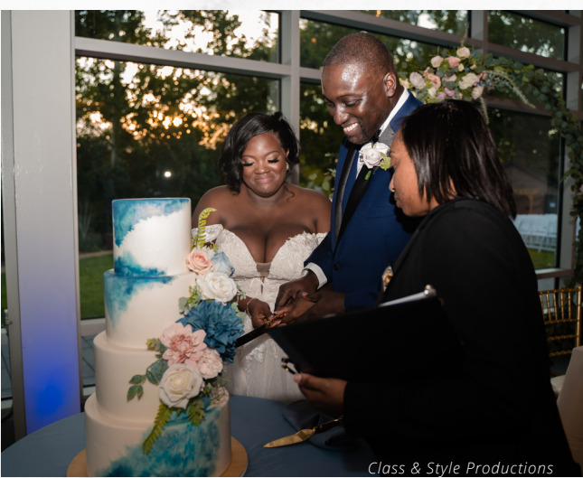
Class & Style Productions

Along with attention to detail, we apply the PRIDE method of event planning to capture the vision of our clients. We offer our clients and their guests a highly *P*ersonalized experience, *R*adiant service, *I*nnovative solutions, *D*istinctive occasion, and an *E*xtraordinary celebration.