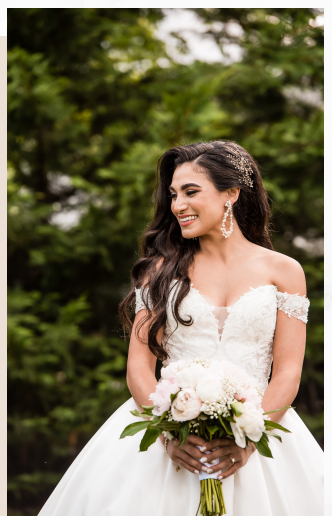
Lauren Brimhall Photography